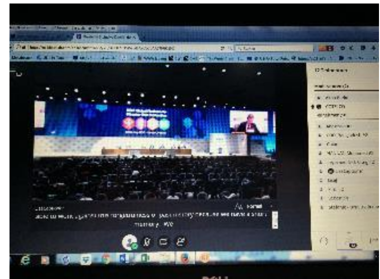
Photo: Web conferencing using Blackboard Collaborate Ultra offered by IDPP