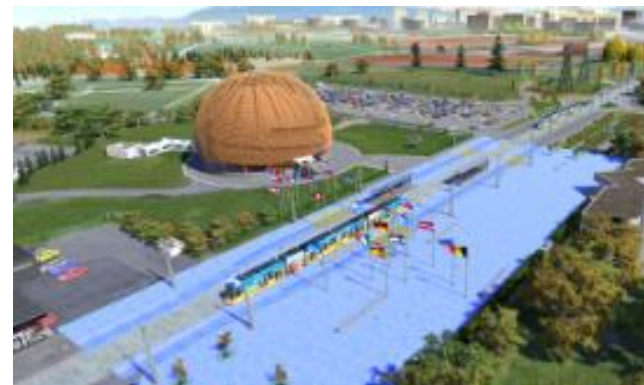
Study on accessibility of CERN's "esplanade"