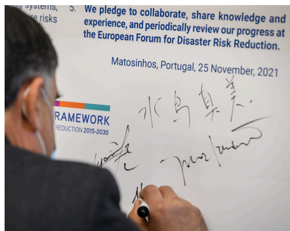
2021 EFDRR. Signing of the Matosinhos Prevention Pledge

Emergency and hospital claims are NOT covered by UNDRR in case of any accidents occurred during your travel.