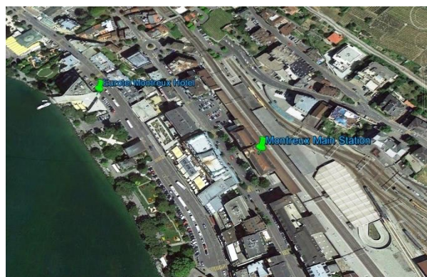
Map 2. Montreux Main Station to the Hotel