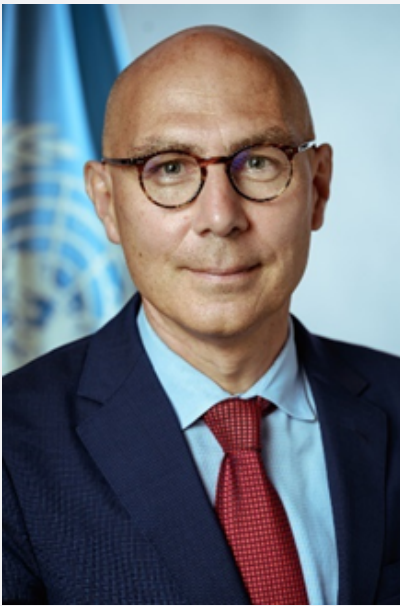
Mr. Volker Türk

Mr. Türk is the current United Nations High Commissioner for Human Rights. He took up his official functions as High Commissioner on 17 October 2022.