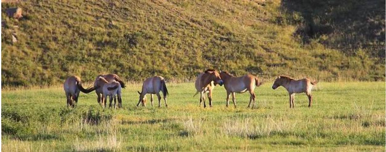
/Gobi Cashmere factory store/