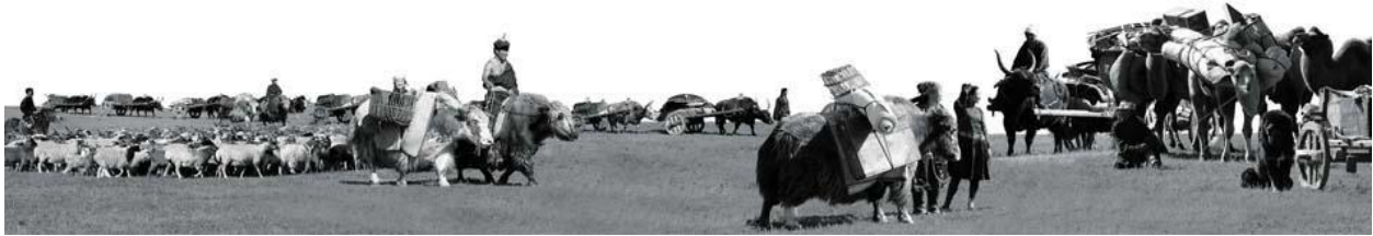
/Mongol nomadic live show/

First morning we will drive to Mongol nomadic tourist camp. At the camp you will see “Mongolian nomads” show which demonstrates traditional living way of real Mongolian nomads and breeding and using of five kinds of livestock and movement from one place to another using ox, yak, camel and horse carts which are the carts. Also Mongolian ger is made of by traditional making and all furniture pots and clothing are antiques reflecting the feature and manner of Central Khalkhs in the beginning of 20th century.