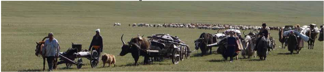
/Mongol nomadic live show/