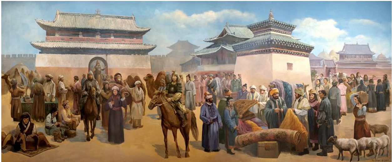
/Kharakhorum city in 14th century/