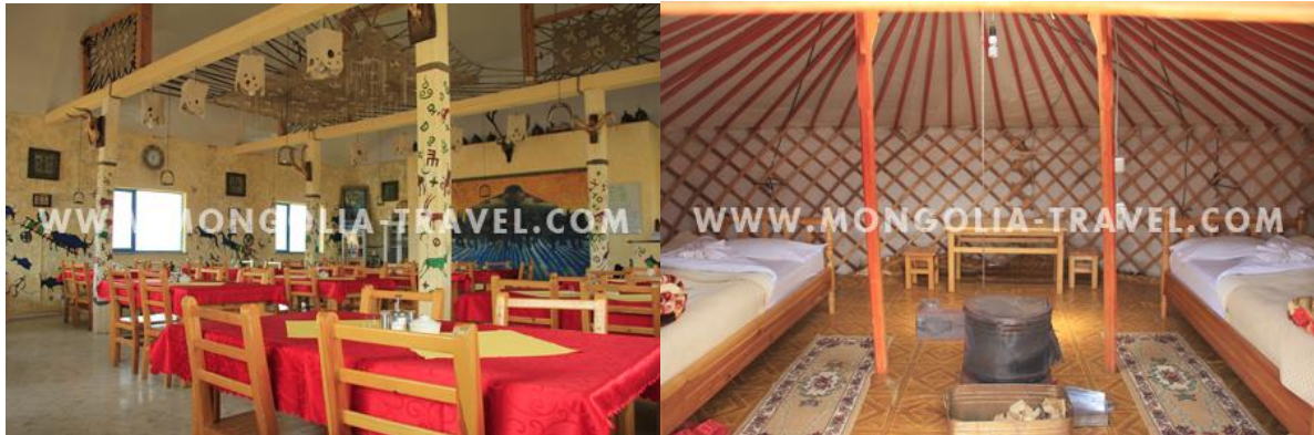
/Talbiun restaurant and interior of ger/