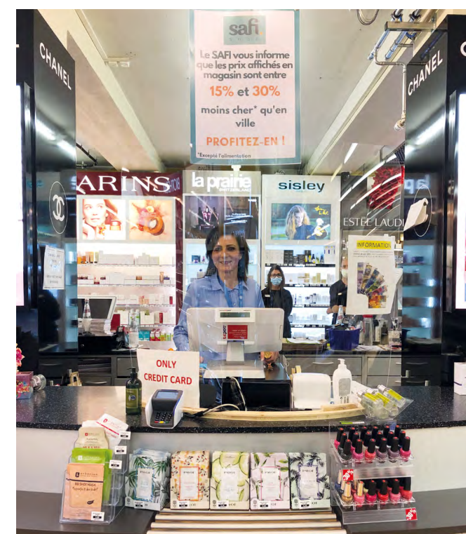
SAFI SHOP Building S - Floor -1

OFICINA DE LAS NACIONES UNIDAS EN GINEBRA BIENVENIDO