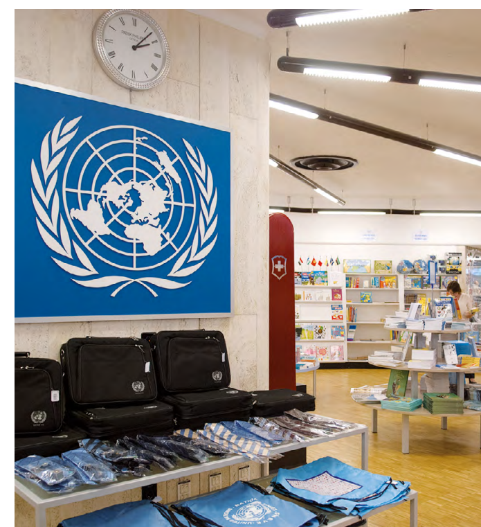
SOUVENIRS / BOOKSHOP Building E - 2 nd Floor