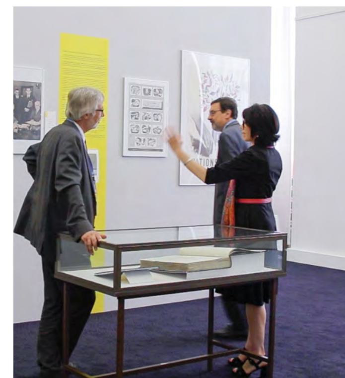
UNITED NATIONS MUSEUM AT GENEVA Building B - 1 st Floor