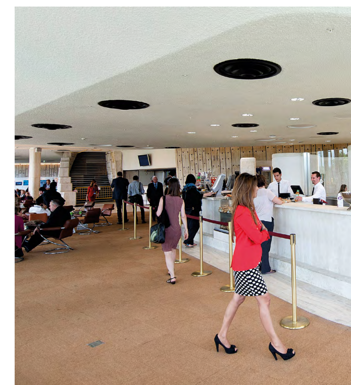
SERPENT BAR Building E - 1 st Floor